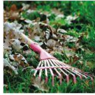
Raking up leaves