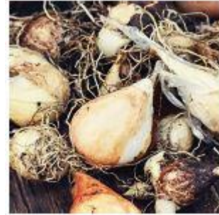
Bulbs ready for planting